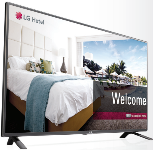
LX330C : 32H"/42"

LG Commercial Lite TVs are designed specifically for hospitality and business environments. With the use of simple user-friendly interfaces and superb images and video, the LX330C series create a more hospitable welcome for guests and customers.